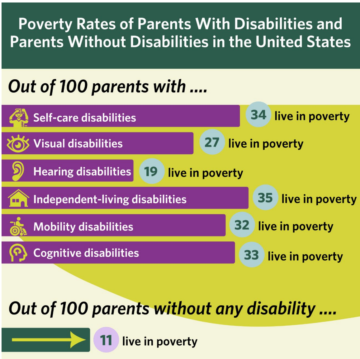
Figure 2. Poverty Rates of Parents with Disabilities and Parents without Disabilities in the United States

Information about the number of disabled parents is very important. This information will help improve the lives of disabled parents. Knowing the number of disabled parents can help make better policies. More data and information is available on the website of The National Research Center for Parents with Disabilities .