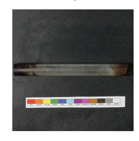
Pipe with residue of crack cocaine with fentanyl