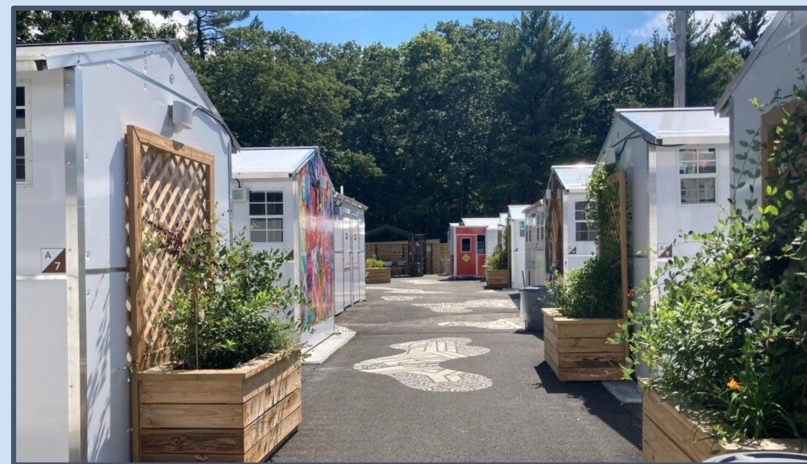
HRH Site: Shattuck Cottages