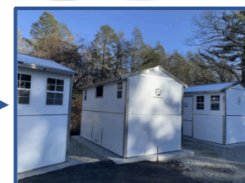
The Shattuck Cottages