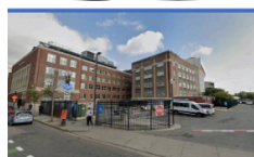
Woods Mullen (Willows)