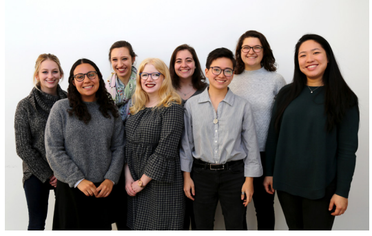
Spring 2019 Undergraduate Fellows