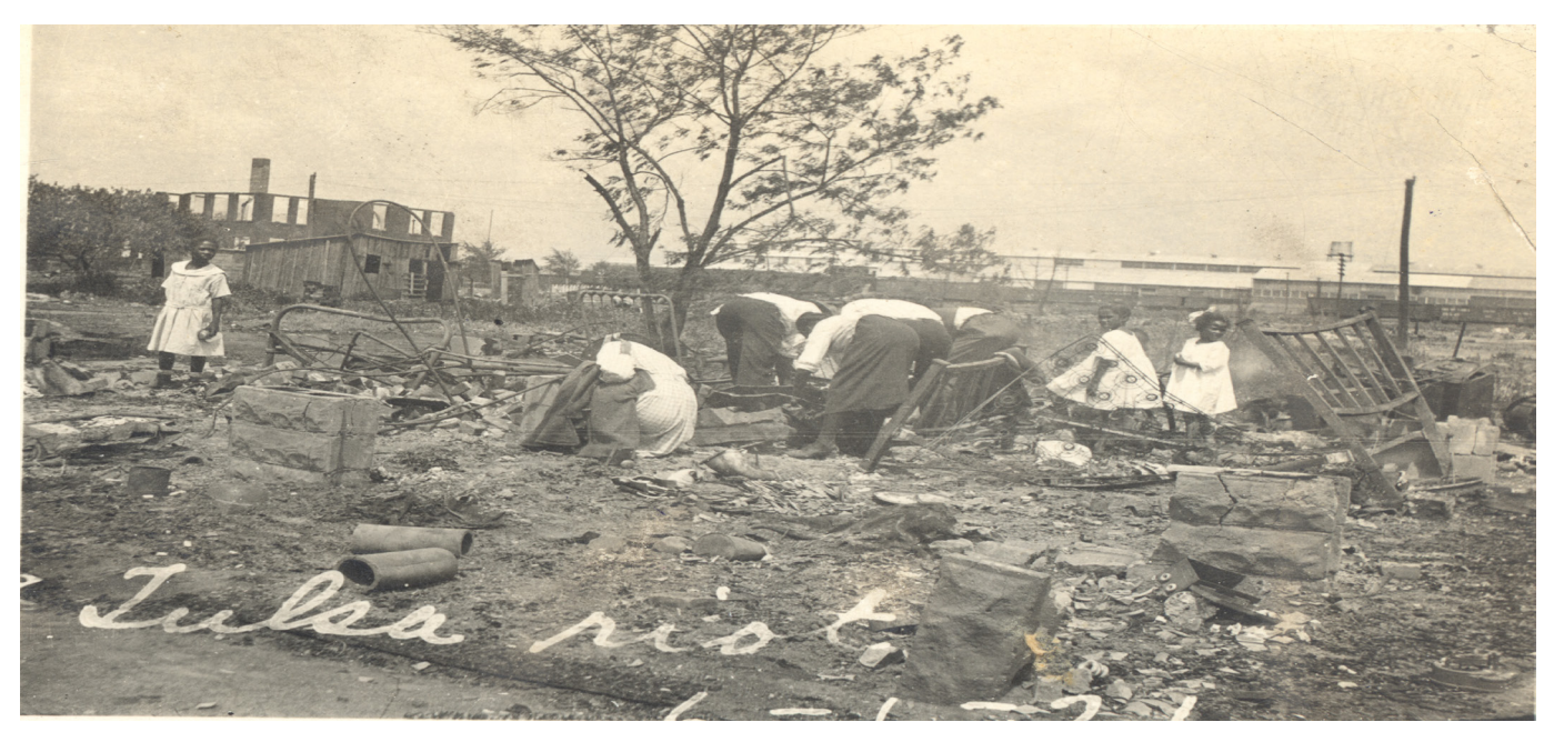
Image: People Searching Through Rubble After The Tulsa Race Riot, Tulsa, Oklahoma, June 1921.

and perhaps 150 people dead.<sup>25</sup> White mob violence occurred in many cities across the nation in the late 1800s and well into the 1900s. There were 26 such riots in 1919 alone. These incidents often resulted in the killing of Black people at the hands of the mob and included criminal prosecutions and even executions of those who resisted the mobs.<sup>26</sup>