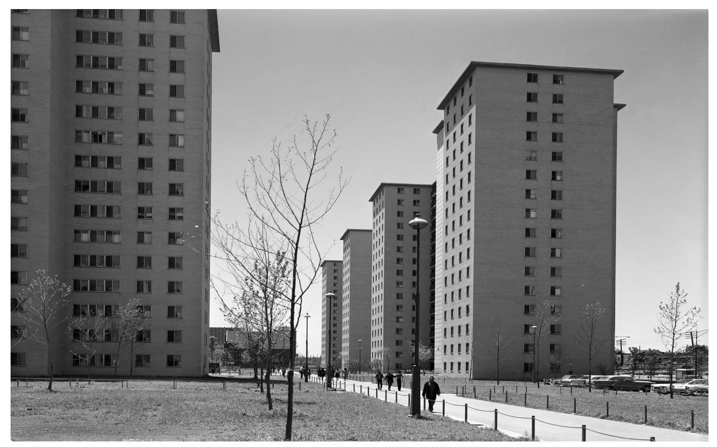
Image: Exterior of Robert Taylor Homes public housing, Chicago, Illinois, July 1, 1964.

Today, a high concentration of race and poverty in U.S. cities reflects both the higher average poverty rates in communities of color and the continuation of racial and ethnic segregation. Paul Jargowsky notes: