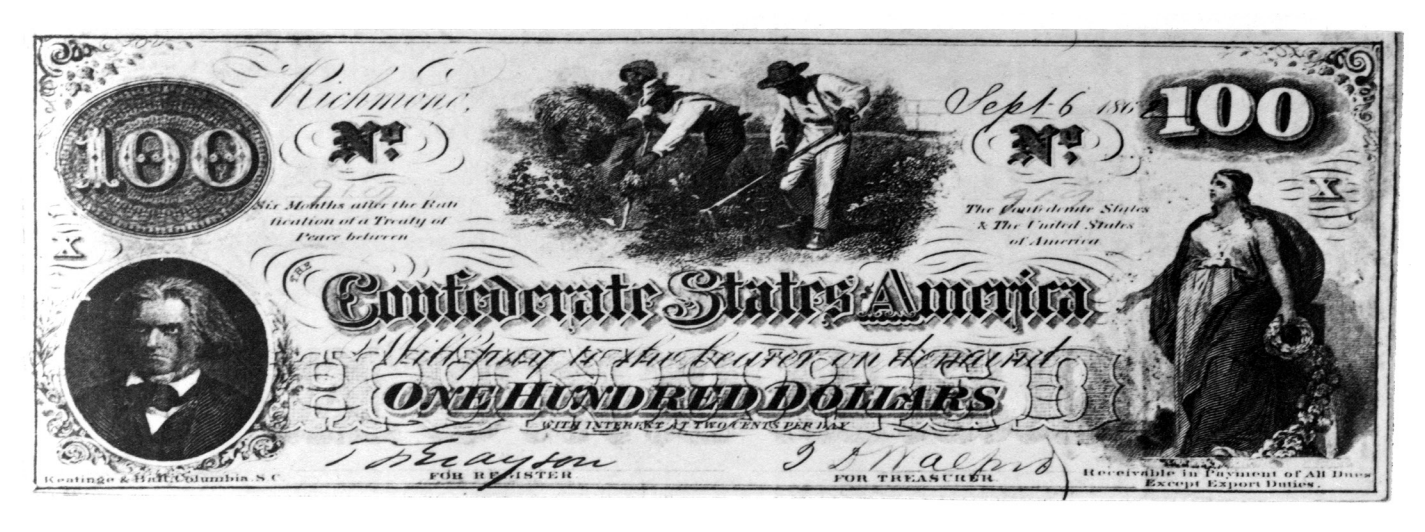
Image: A one hundred dollar note issued by the Confederate States of America, late nineteenth century.

In the 17th and 18th centuries, European settlers generated wealth by claiming ownership of lands previously inhabited by Native Americans, forcibly removing these indigenous people, and by exploiting Native American labor. In these original acts of appropriation, wealth-building for Whites is inextricably linked to wealth-stripping of communities of color. The emergence of American chattel slavery starting in 1619, fueled by the Trans-Atlantic Slave Trade, was crucial to building the American economy. These patterns of exploitation that created White wealth were further cemented through political power, law, and policy, and catapulted the standard of living for Whites in the United States to among top in the world by the 19th century. In the second settles wealth by the 19th century.