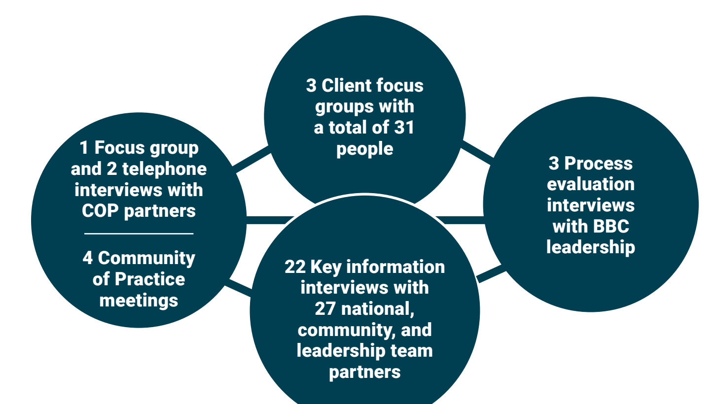
Figure 4. Data Collection

IASP researchers collected the primary data for this report by conducting interviews with key partners