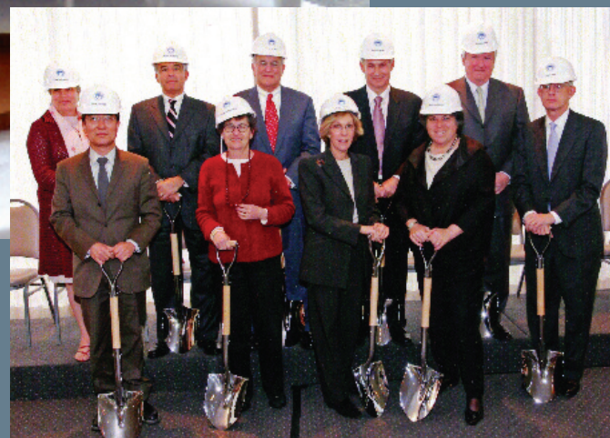
Architect's model of the rear view of the Schneider Building At right, lead donors and dignitaries take shovels in hand at the Schneider Building groundbreaking in May