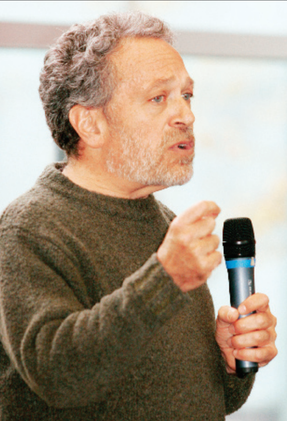
Robert Reich, Maurice B. Hexter Professor of Social and Economic Policy

News & Views: Why do you think President Bush continues to try to sell his Social Security plan despite clear opposition from many directions?