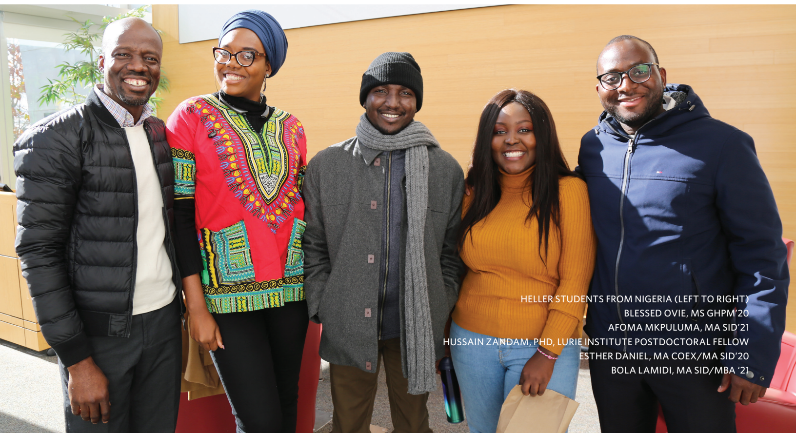
HELLER STUDENTS FROM NIGERIA (LEFT TO RIGHT)