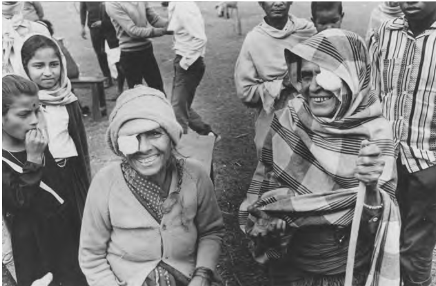
AJWS supported curable blindness programs in India and Nepal through the Seva Foundation