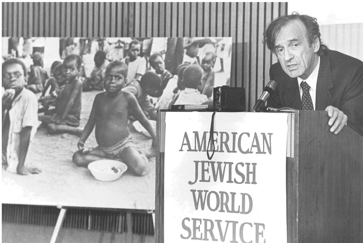
Elie Wiesel, founding member of the board, speaking at the official launch.