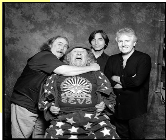
Wavy Gravy with David Crosby, Jackson Browne & Graham Nash