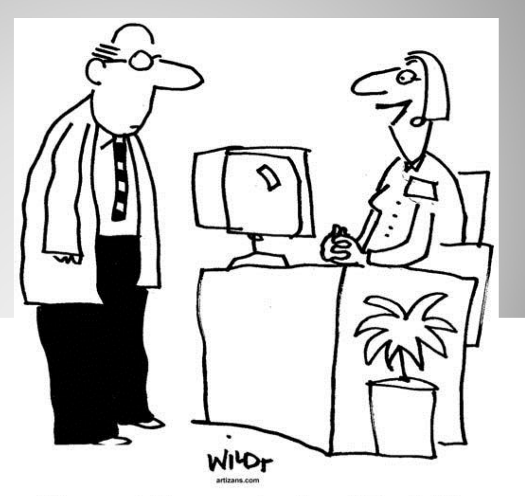
"You needn't worry about confidentiality. Your medical records were carefully transferred to computer and accidently trashed."