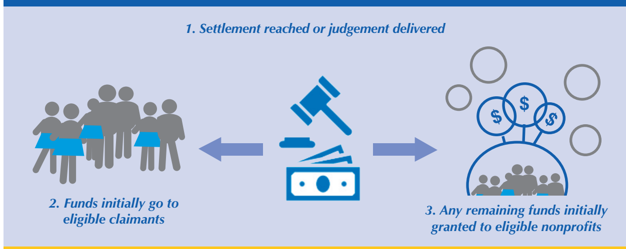
FIGURE 2: THE CY PRES PROCESS

Strauss & Co. alleging that the company pressured retailers to overcharge consumers. Given the complexity of the facts of the case, the litigation made its way to the California Supreme Court. The court decided to enact fluid recovery through one form of cy pres , a consumer trust. The California Supreme Court recognized the historic nature of its decision, stating, "Today's ruling will serve as a source of guidance for both the trial court on remand and for other courts in confronting the