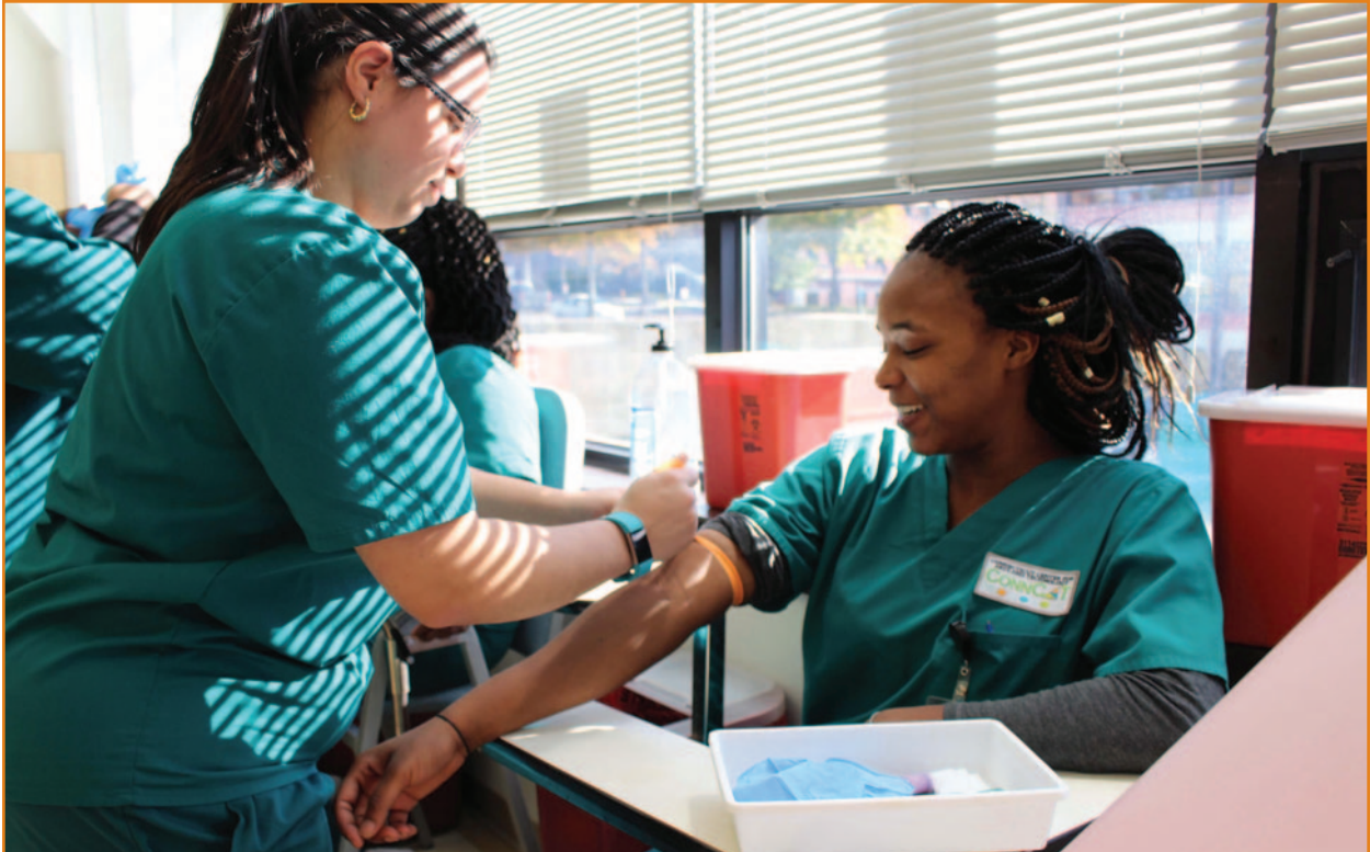
Connecticut Center for Arts and Technology