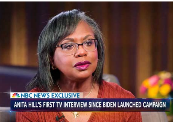
ANITA HILL INTERVIEW ON NBC NEWS